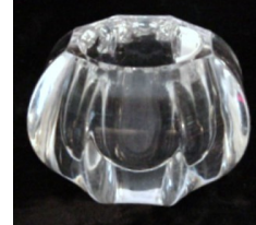
2. EARLY PURITAN