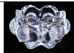
5. Large Bullseyes