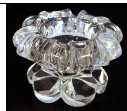
6. Sandwich Capstan