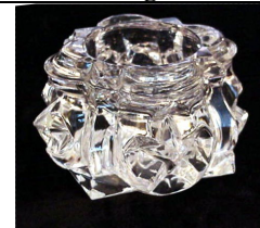
4. O'Hara #4