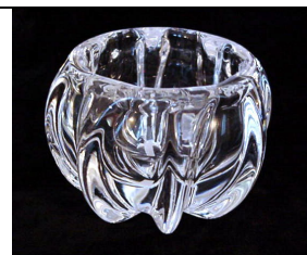
1. Pillar Molded Salt