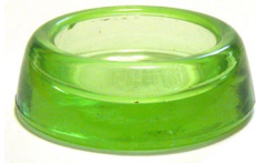
Caster Cup Salt

The show with the open salts segment aired on November 12 th . The producer called us the night before to be sure we remembered. It showed a copy of our Salty Comments and mentioned that we would send a sample copy to anyone who asked – details on Martha’s web site. Starting that afternoon we were deluged with requests and questions. There were over 100 emails, most asking about the sample copy for themselves or a relative, but some asking questions about a salt or salts they had. We spent much of the time for the rest of the week responding. We told all of the people who wrote about the central web site that Debbi Raitz manages (WWW.OPENSALTS.INFO), which gives a complete picture of the books available, the clubs and the upcoming Convention. How many will choose to become involved on a continuing basis remains to be seen.