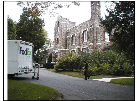
Martha Stewart Studio

The next morning we showed up at 9:00 as instructed. This time the set was crowded with lighting, sound and camera people, most with headsets on. They use 4 cameras working simultaneously, with each viewing a different angle or having a different perspective on the action. The monitor shows all 4 of the camera pictures at once. They take about 10-15 minutes of "action" and edit it down to about 6 minutes for the final show. Martha had a group of her salts at the end of the counter where we started. It seems she doesn't use shakers at all – she prefers open dishes! She is an enlightened lady!