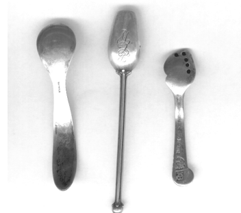
Figure 3 - Bottom View