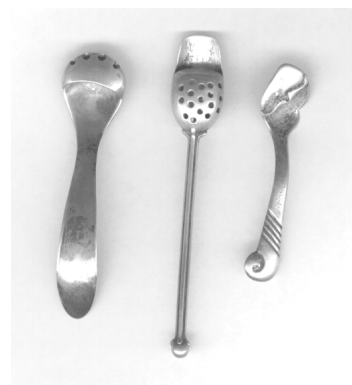
Figure 3 (Top View)