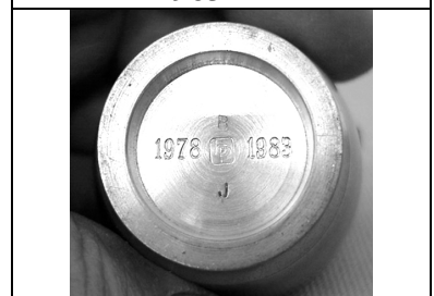
1983 Salt Mark