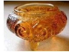
H&J 2950 – Davidson Open Salt Clear – Amber – Black –Purple Slag This one has been reported possibly made in Milk, Blue Milk, Malachite and other Slag but not confirmed.