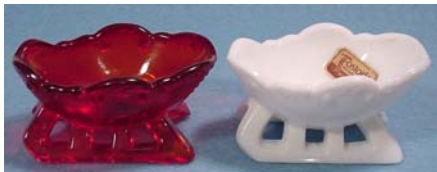
H&J 3735 - Small Fostoria Sleigh Salt Red - Clear - Milk Glass - Pink

This is a compiled list of colors and information, that I have found or has been reported to me by Salt Club members since we started looking in MOSS MEMO 5, July 1997. Numbers in ( ) indicate shades known