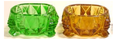
H&J 367 – Footed Salt Dark Blue – Med Blue - Pale Aqua Blue – Amber – Clear – Avocado Green – Med Green – Vaseline Green – Milky Blue – Milky Blue Decorated