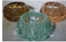
Paden City Nr 10 Individual Salt Amber – Pink – Pale Green – Lt Blue

Pink Flared top, marked & band around bowl has buttons. Blue Green – Clear – Marigold – Pale Yellow – Pink w/Gold Trim Straight top, marked & band around bowl has button.. Clear