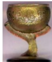
H&J 3581 – Tree of Life Salt Clear – Amber Some conversations on the Amber as some think that it may have been irradiated to change color.