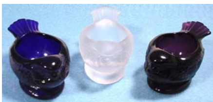
H&J 1001 - Fostoria Bird Salt Red - Amethyst - Amberina - Clear - Silver Decorated - Clear Frosted - Milk Glass - Dark Green - Cobalt