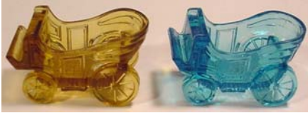
H&J 417 – Coach Salt Blue – Clear – Amber