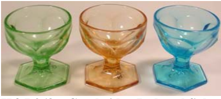
H&J 368 – Cambridge Pedestal Salt Green – Blue – Pink – Clear – Lt Amber