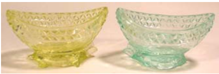
H&J 506 – Wildflower Pattern on back of Turtle Salt Amber – Lt Blue - Lt Green – Canary – Clear