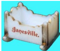
H&J 855 – Cradel Salt Clear – Amber – Blue – Milk – Milk Decorated