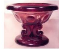
Coddington 31-3-1 Clear – Amethyst – Cobalt