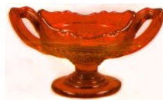
H&J 821 – Cambridge MtVernon Salt Marked with C in Triangle only. Has been reproduced in many colors unmarked Clear – Milk – Crown Tuscan – Red – Dark Green – Cobalt –Milk w/Gold Trim