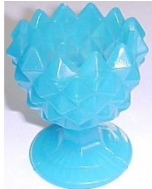
H&J 3526 – Sawtooth Salt With Cover, Clear – Milk W/O Cover, Clear – Milk – Blue Milk