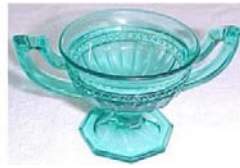
H&J 2093 – Fancy Colonial Salt As Pictured in H&J. Flared top, unmarked & plain band on bowl.

Pink Flared top, marked & band around bowl has buttons. Blue Green – Clear – Marigold – Pale Yellow – Pink w/Gold Trim Straight top, marked & band around bowl has button.. Clear