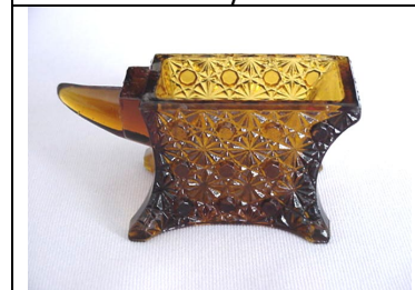
Co-Operative Flint Salt