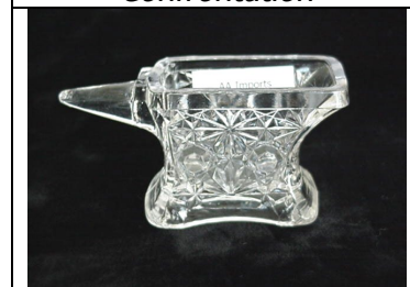
Wright Ash Tray or A.A. Imports Salt Dip