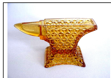
Windsor Glass Toothpick

If you have any salt-size anvils that don't match these, we'd love to hear about them.